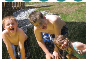
It's Their Legacy