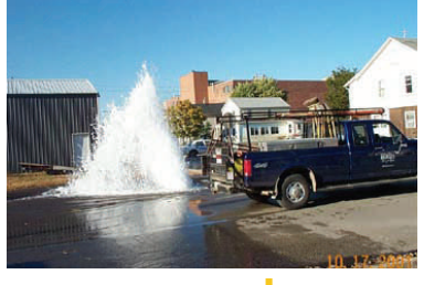
Backsiphonage may occur due to a water main break or other lowpressure incident such as a fire.