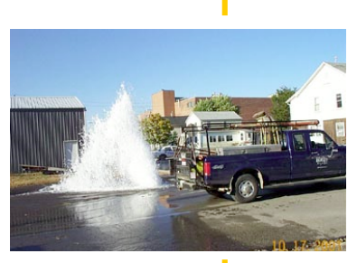
Backsiphonage may occur due to a water main break or other lowpressure incident such as a fire.